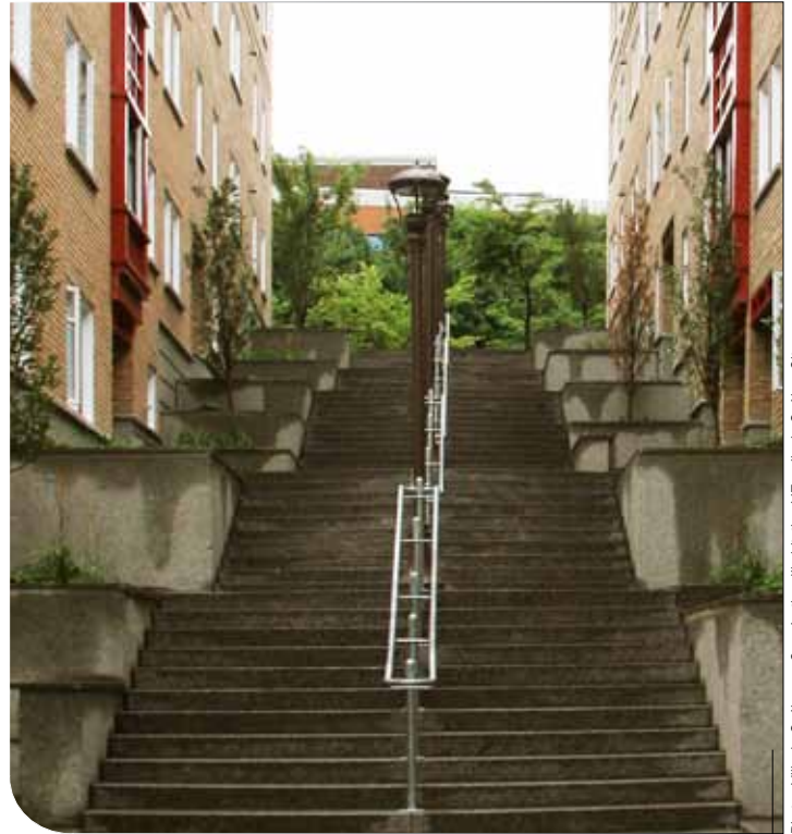
Coopérative d'habitation L'Escalier in Québec City.

A series of concrete housing measures are also offered to the residents of Nunavik as part of the Plan Nord. Through amounts allocated by the provincial government, the SHQ will renovate 482 social housing units and construct 300 more units. Furthermore, the completion of 200 dwellings through a new program promoting access to residential ownership will expand the private housing market in Nunavik.