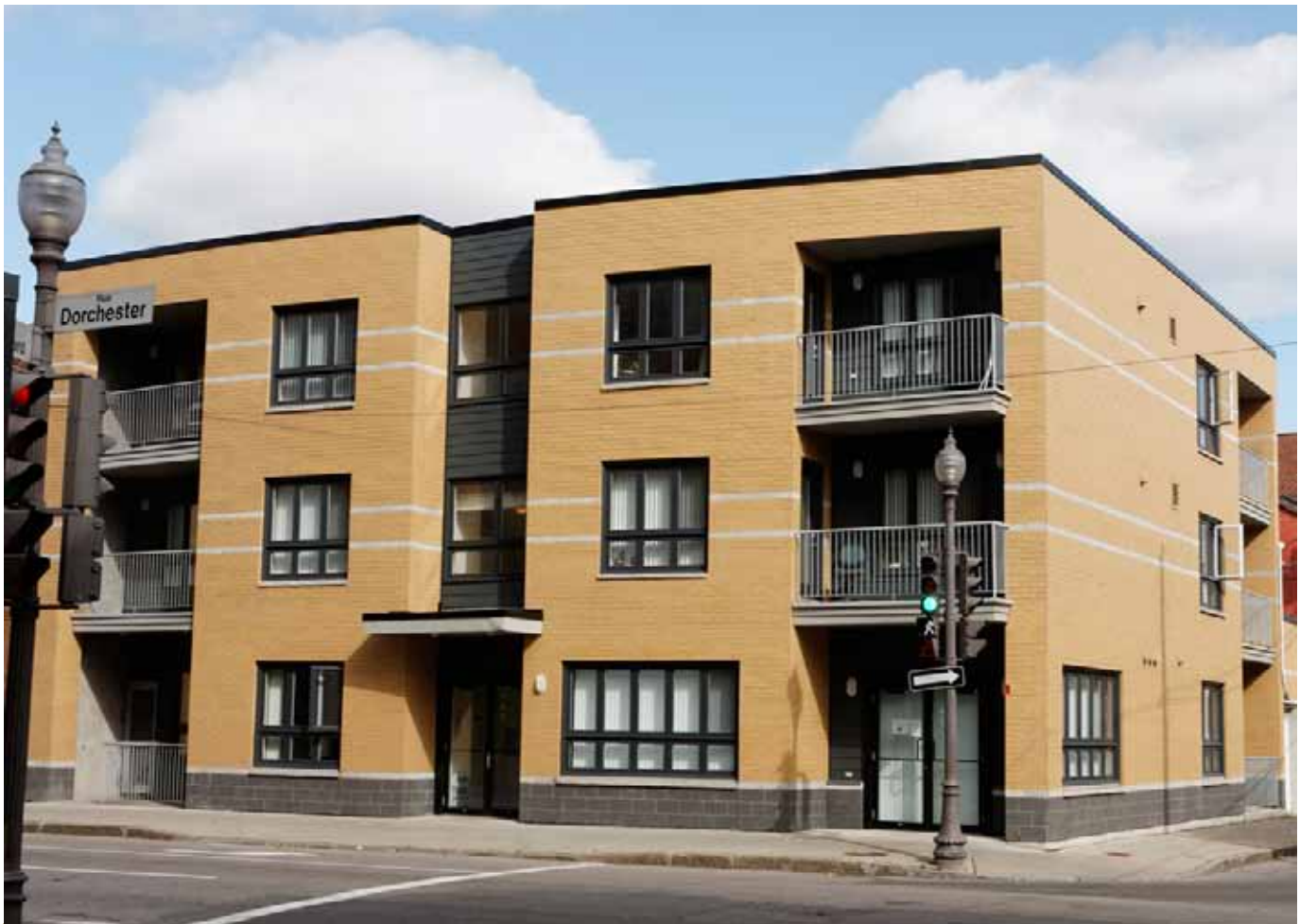
11-unit building on Dorchester Street in Québec City for people with mental health problems. The building is managed by PECH (Programme d'encadrement clinique et hébergement [Clinical Supervision and Accommodations Program]).

Thanks to the work of its partners, the SHQ helps in meeting the basic needs of people who have functional social problems resulting from mental illness or intellectual disabilities. In reality, these measures help people who could be exposed to homelessness. It might be a matter of providing them with access to temporary or permanent housing, based on the needs of beneficiaries and the mission of the organization in question.